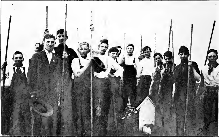
SUGAR CITY, IDAHO, M. I. A. LOY SCOUTS OF AMERICA

bers of the General Boards will visit the schools that they may assist in injecting into the work the spirit of the Mutual Improve-